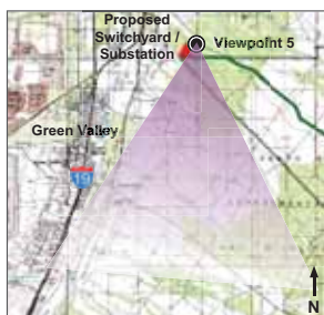
Photograph Location: Facing south from Sahuarita Highlands on East Broadwater Way towards Santa Rita Road. Photo point is approximately 0.50 mile from nearest transmission line.