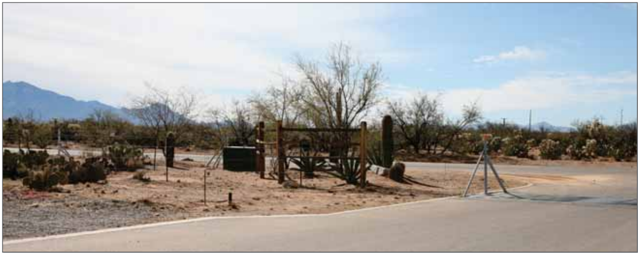
Existing Condition – Sahuarita Highlands residences along East Broadwater Way, Santa Rita Road, and Santa Rita Mountains