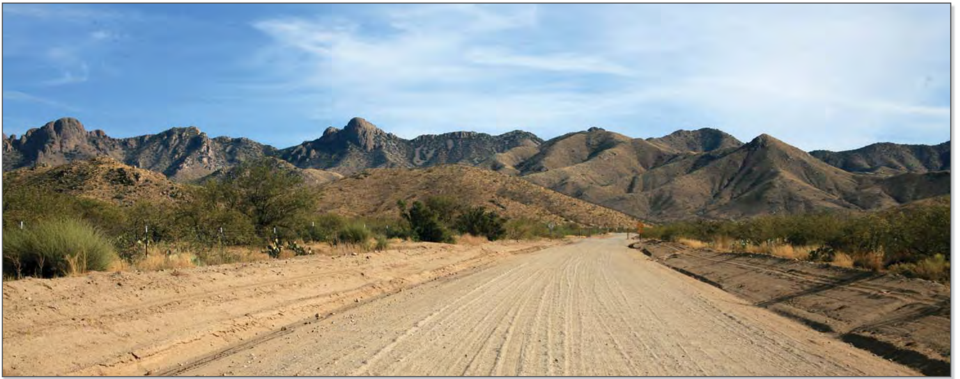
Existing Condition – Santa Rita Road within the Santa Rita Experimental Range