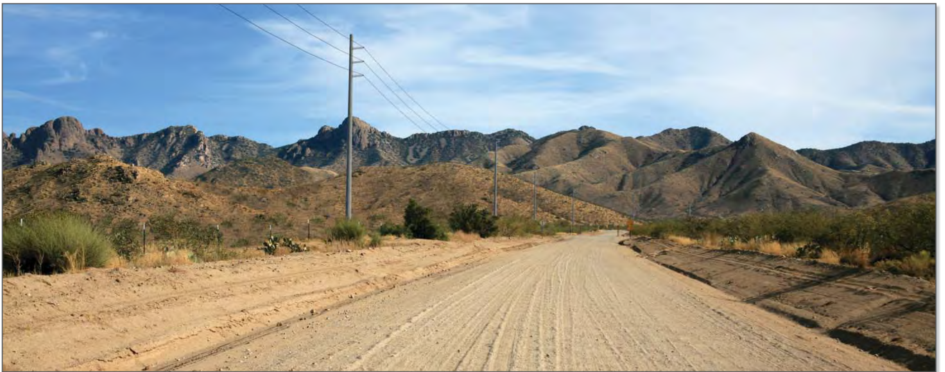
Simulated Condition – Proposed 138kV galvanized steel single-circuit transmission lines and water pipeline with shared access road