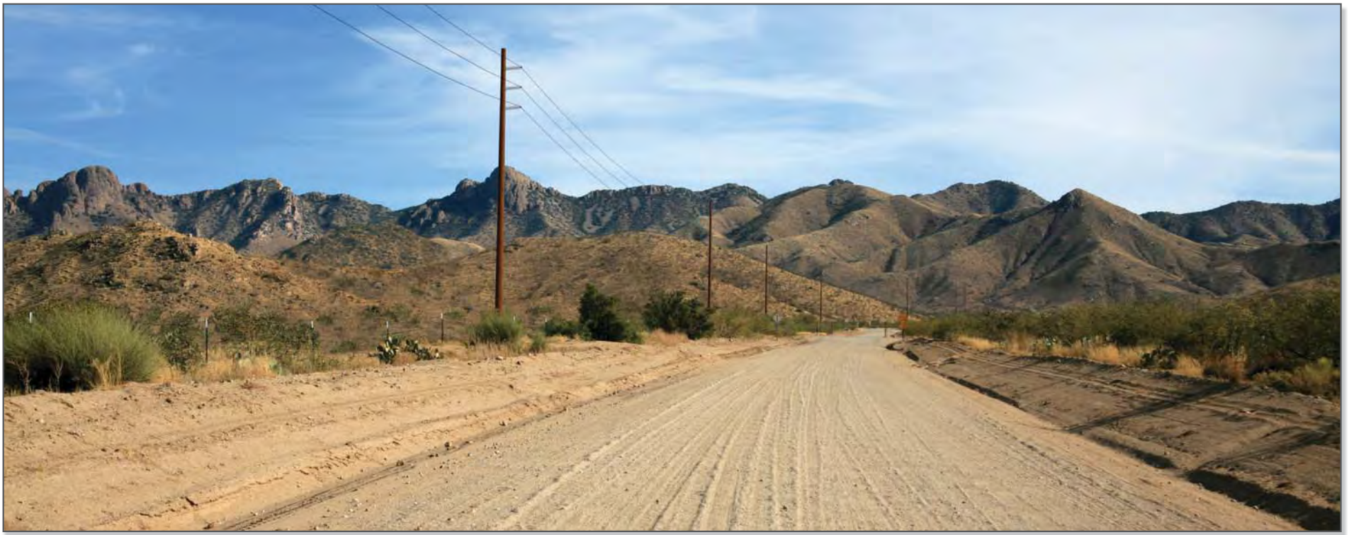
Simulated Condition – Proposed 138kV corten steel single-circuit transmission lines and water pipeline with shared access road