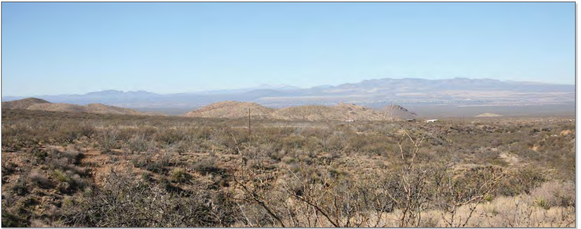
Existing Condition – Existing distribution lines and residences along Helvetia Road