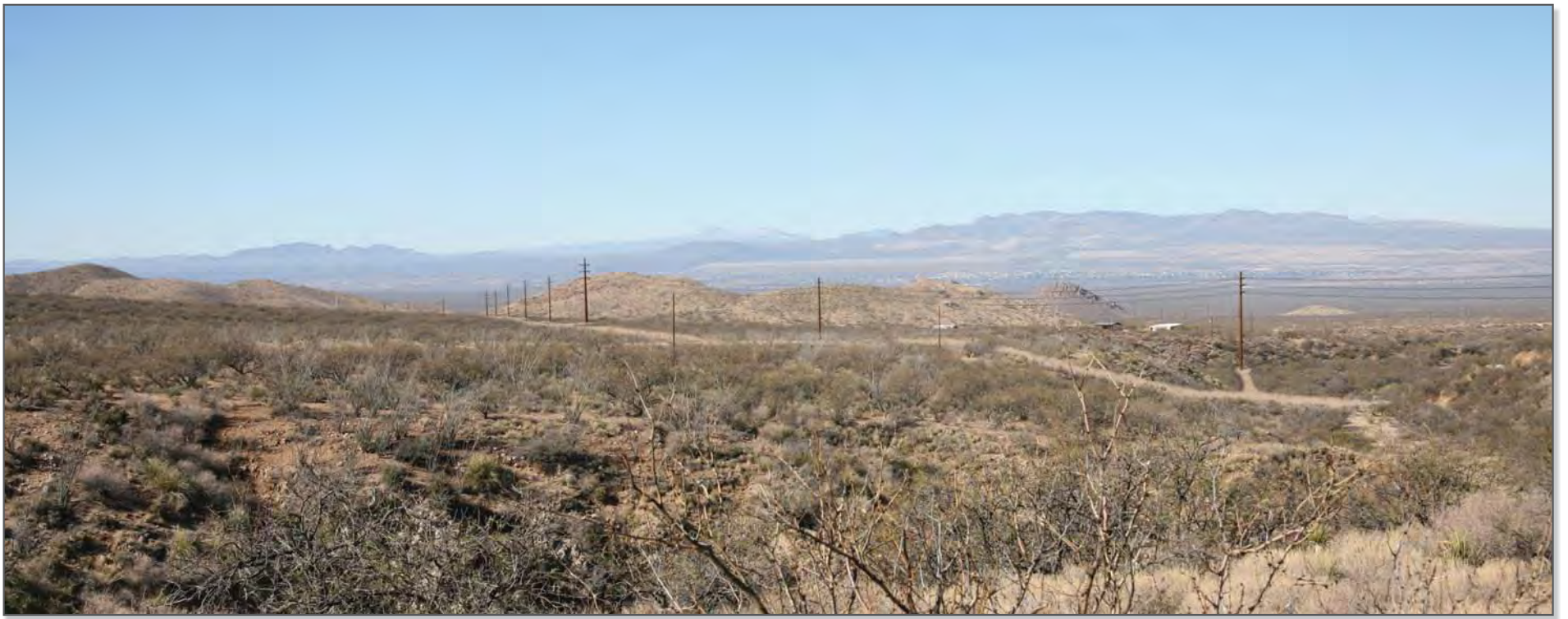
Simulated Condition – Proposed 138kV corten steel double-circuit transmission line and water pipeline with shared access road