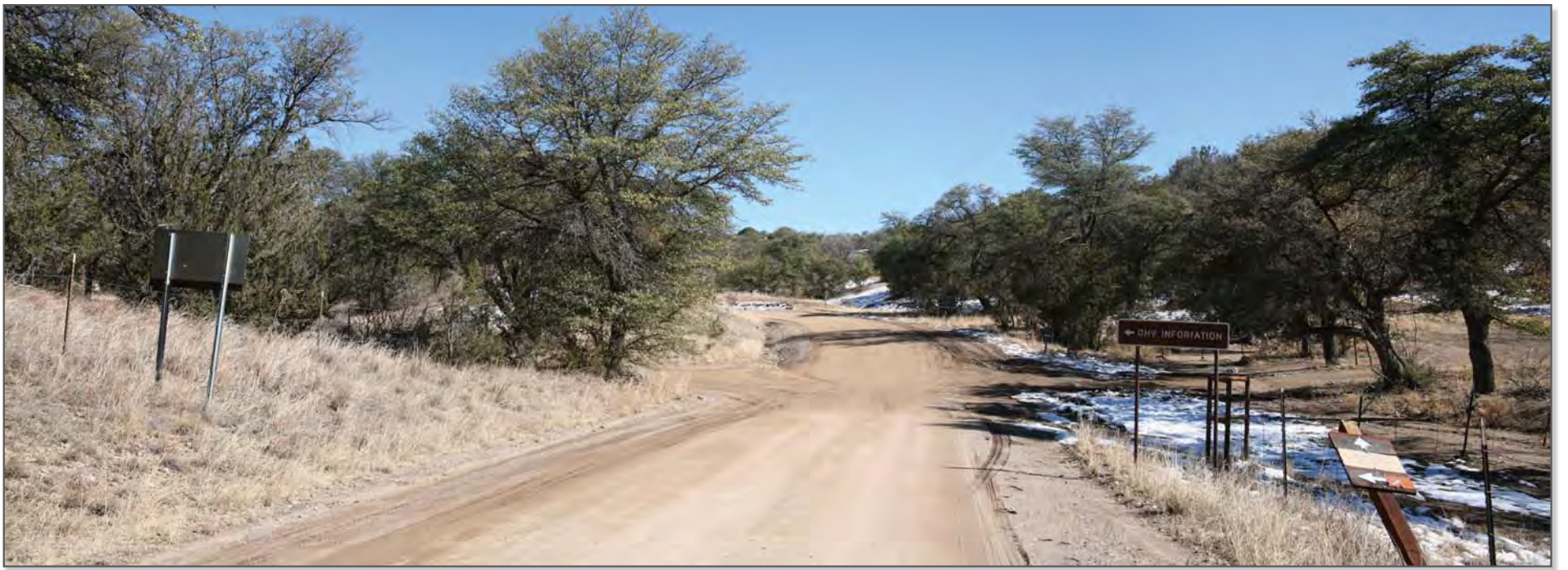
Existing Condition – Box Canyon Road within the Santa Rita Mountains