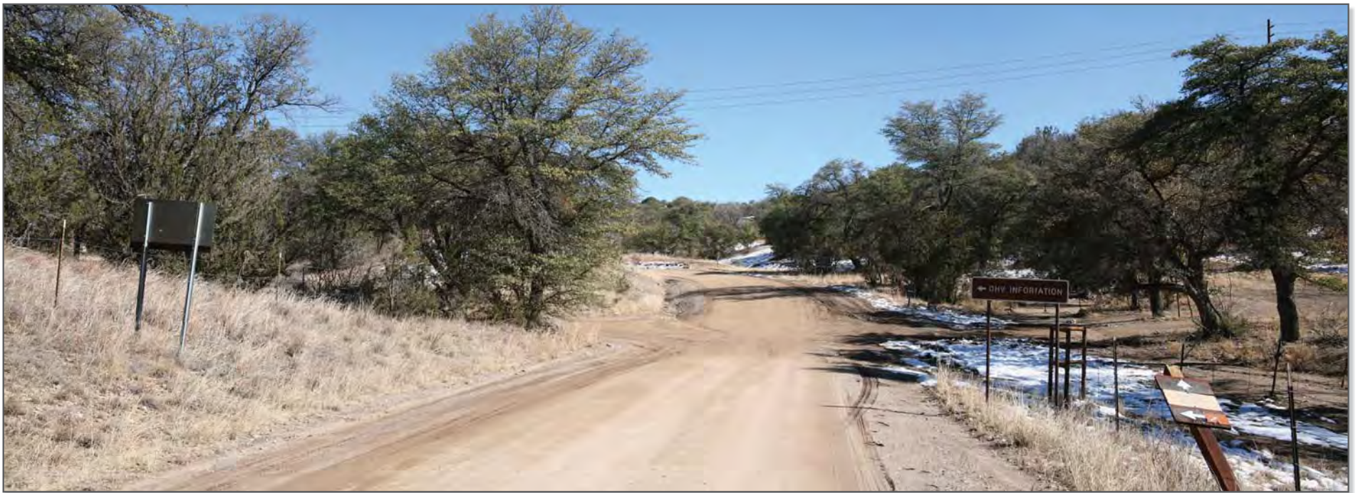
Simulated Condition – Proposed 138kV corten steel single-circuit transmission line