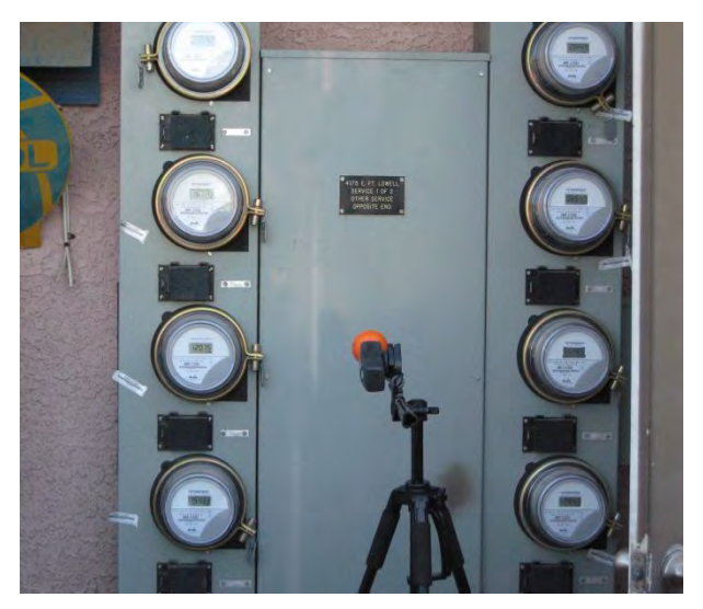
Figure 3. TM-195 placement at a bank of meters.