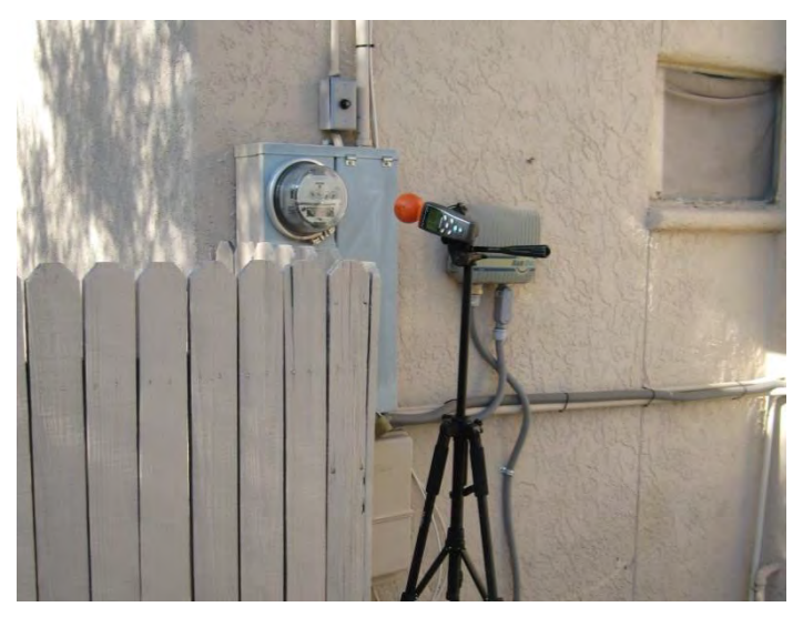
Figure 2. TM-195 placement at a single-family residence.

The TM-195 was secured to a tripod and adjusted to the same height as the center of the face of the meter. For single meters, the probe was directed at the center of the electric meter. For a bank of meters, the probe was directed toward the center of the bank of meters and raised to the height of the middle of the bank of meters. The sampling device was placed one foot away from the electric meter (s), perpendicular to the front face of the meter.